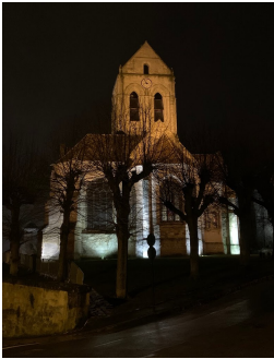
Church in Auvers from Van Gogh's painting

The region's artistic credentials, and its renown amongst the general public, are largely attributed to its association with Impressionism. A notable example of this is the relocation of Camille Pissarro to the Vexin capital, Pontoise, in 1872, where he resided until 1882. This period is significant as it resulted in the formation of a notable artistic circle, which included prominent figures such as Paul Cézanne, Ludovic Piette and Paul Gauguin. A few years later,