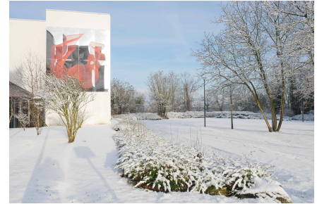
CY AS backyard in winter

The Institute for Advanced Studies (CY AS) was established in 2007, with a mission to promote research in all scientific disciplines. After a period of virtual operation, the Institute now has its own building, with working rooms and offices, guest accommodation and a dedicated team. The Institute's location, in the midst of nature and inspiring tranquillity, makes it easily accessible by train from Paris and provides an ideal environment for thinking and working.