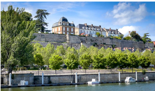
The Castle of Pontoise

Vincent Van Gogh followed his advice and painted some of his most extraordinary works in Auvers-sur-Oise, before dying there in 1890.