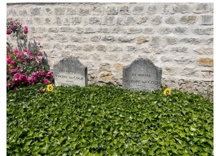
The tombs of the Van Gogh brothers in Auvers-sur-Oise

The Institute is located in close proximity to Etangs de Cergy, a large leisure park offering a wide range of sporting activities, including tennis, paddle, kayak, and water skiing. The park is accessible from the Institute by a bus or on foot (40 minutes walk) via a forest path or along the riverbank. Last but not least, the centre of Paris is easily accessible by train from the nearby station, with a journey time of approximately 35 minutes.